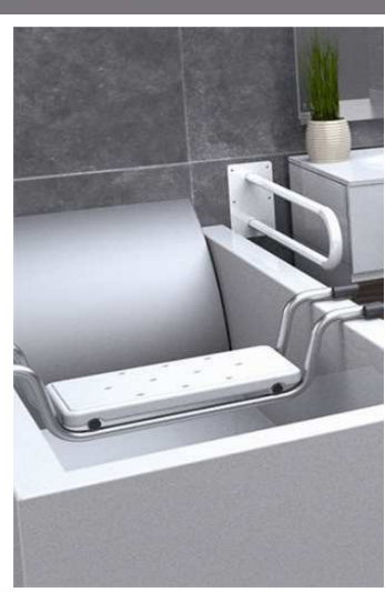
MASTERLINE by Bisk