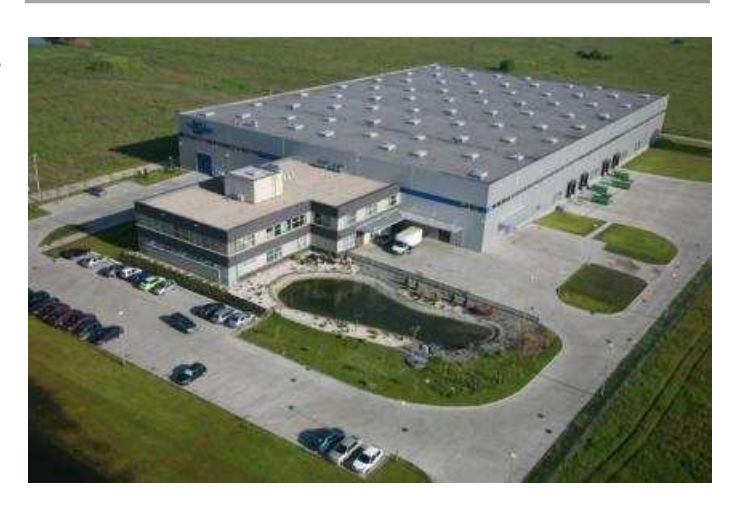
Company headquarters in Łubna, Poland 8 000 sqm of warehouse