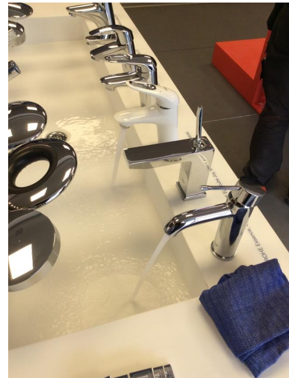
Working shower fountain - high quality finishing